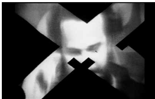
Jean Otth, Strip-Tease TV (from the TV-Perturbations series), 1972, video, b&w, sound, 14'18" Musée cantonal des Beaux-Arts de Lausanne. Acquisition, 1973

Following graduation from the École des Beaux-Arts of Lausanne (1961-1963), Jean Otth initially focused on painting. He modified the classic supports and techniques by working with sand, for example, or by transposing his painting from canvas to mirrors. In the latter case, the landscapes he did never totally cover the surface. Thus, the work's immediate surroundings are reflected in the support, which is transformed into a "light machine that all the variations of daylight activate," as the artist put it. Thanks to the first shows of international art mounted in Switzerland, notably by Harald Szeemann at Bern's Kunsthalle, Otth discovered new mediums and techniques. Early on it was drawing and painting with spray paint, which he used to develop increasingly abstract motifs, then video art, starting in 1972.