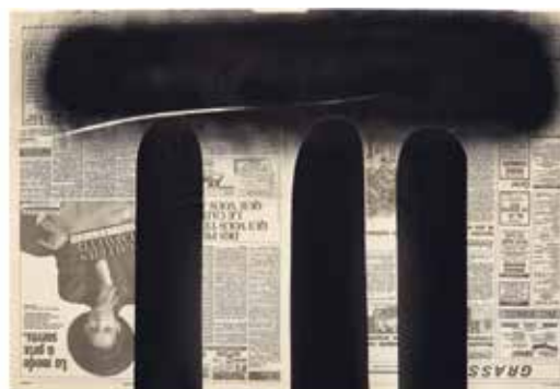
Jean Otth, Sans titre [Nice-matin] , 1986, acrylic spray paint and collage on newspaper, 58 x 84 cm

Through the intermediary of a mirror placed between his model and camera, these two videos explore the subject of the “obliteration” (in the sense of masking or hiding) which runs throughout Otth’s work. Indeed, masking the subject, for the artist, enables us to see it better, learn how to experience it, and, by partly masking it, portray “the erogenous dizzying imbalance of lack and absence.” The artist works here with black and white spray paint, applying areas of shadow and light to the reflection of the model, who slowly moves, while the focal point for the camera shifts from the body and the face of the woman, to the hand that wields the spray can. Curves and patches of paint create moving images that exist between figuration and abstraction, introducing “an endless loving dialogue in which each interlocutor uses his or her own language.”