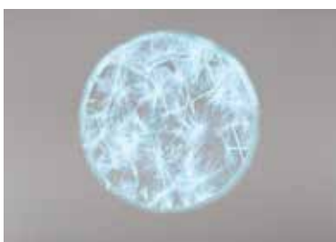
13. Jean Otth, Signe de vent IV , 2012, video projection, colour, silent, 3'48" Coll. MAMCO, gift of the artist, inv. 2013-80