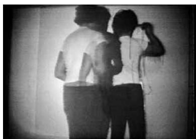
2. Jean Otth, Limite E (from the Limites series), 1973, video, b&w, sound, 10'14" Musée cantonal des Beaux-Arts de Lausanne. Acquisition, 1973