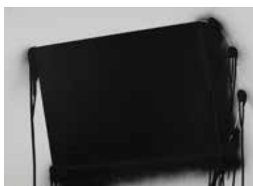
10. Jean Otth, Untitled , 1987, paint, acrylic spray paint and collage on paper, 73 × 102 cm Collection of Virginie Otth and Philémon Otth