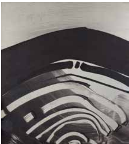
Jean Otth, Féminin III , 1966, paint on mirror, 100 x 90 cm Musée cantonal des Beaux-Arts de Lausanne. Acquisition, 1967