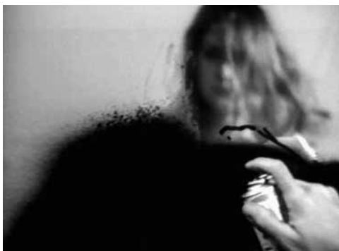
Jean Otth, Oblitération II (from the Vidéo-miroirs series), 1975, video, b&w, sound, 7'19"

Musée cantonal des Beaux-Arts de Lausanne.