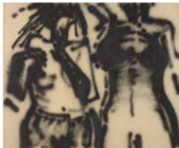
8. Jean Otth, Lo! V.S. et Tatiana K. , [1983], paint and acrylic spray paint on paper, 172.6 × 150.3 cm Musée cantonal des Beaux-Arts de Lausanne. Acquisition, 1983