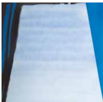
1. Jean Otth, La fabrique du ciel , 1969, mixed media on canvas, applied by brush, air brush and spattering, 170 x 170 cm Collection d'art Nestlé, Vevey

Other indications (dimensions, techniques, etc.) are welcome but not obligatory. Once the document is published, we would be grateful if a copy was sent to the museum's press department: Service de presse, Musée cantonal des Beaux-Arts, Lausanne.