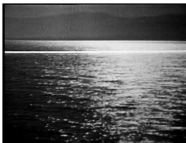
4. Jean Otth, Limite B (le lac) (from the Limites and Vidéo-paysages series), 1973, video, b&w, sound, 6'10" Musée cantonal des Beaux-Arts de Lausanne. Acquisition, 2015 Video still © Atelier für Videokonservierung, Bern