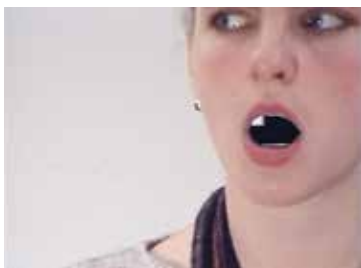
7. Jean Otth, Fast Food , 1985, vidéo, couleur, sound, 2'21" Collection du Fonds d'art contemporain de la Ville de Genève (FMAC). Acquisition, 1994 Video still © Atelier für Videokonservierung, Bern