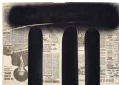
9. Jean Otth, Sans titre [Nice-matin] , 1986, acrylic spray paint and collage on newspaper, 58 × 84 cm Collection of Virginie Otth and Philémon Otth