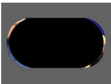
12. Jean Otth, Muse parergonale 01 , 2007, video projection 7', colour, silent, on paint on wall, various dimensions (minimum width 200 cm) Collection of Virginie Otth and Philémon Otth