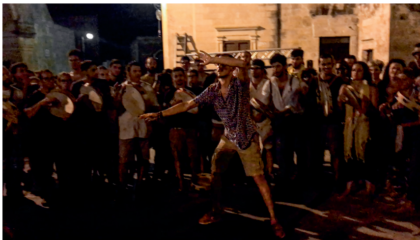
Emily Jacir, We Ate The Wind , 2023 Two-channel film installation, sound, 31'