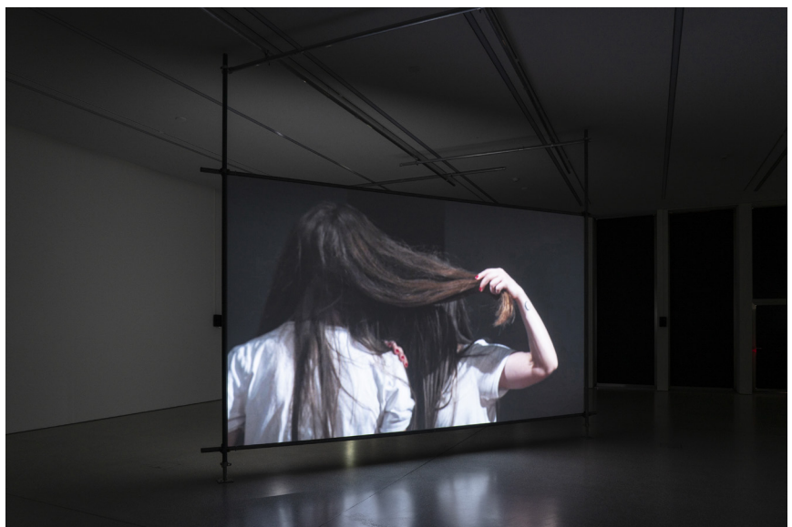
Captions to be reproduced: View of the exhibition Emily Jacir. We Ate the Wind at the Musée cantonal des Beaux-Arts de Lausanne, 2023 © Emily Jacir